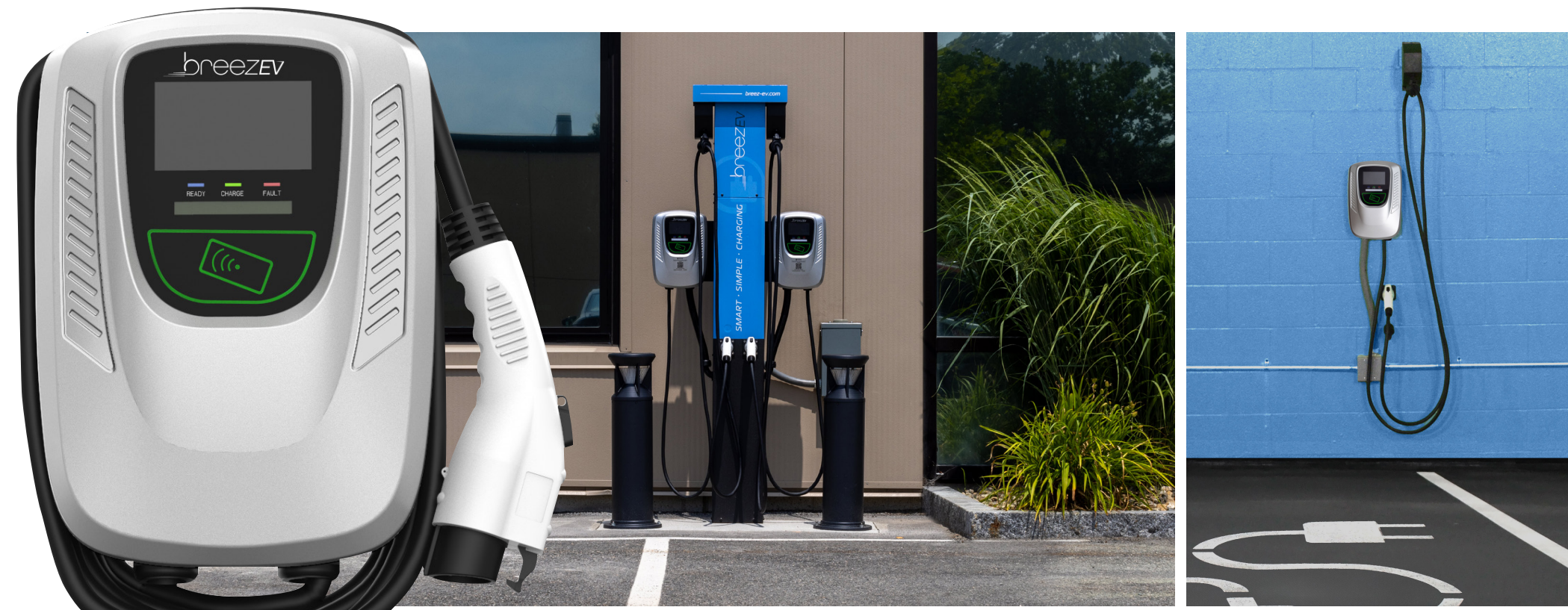
← P48 / P80

SMART LEVEL 2, ELECTRIC VEHICLE CHARGERS EQUIPPED W/ LCD SCREEN, RFID, OCPP NETWORKED. Up to 80A charging power along with built-in SWITCH software. Pedestals and mounting options are all made in the USA, and can be custom branded to match your needs.